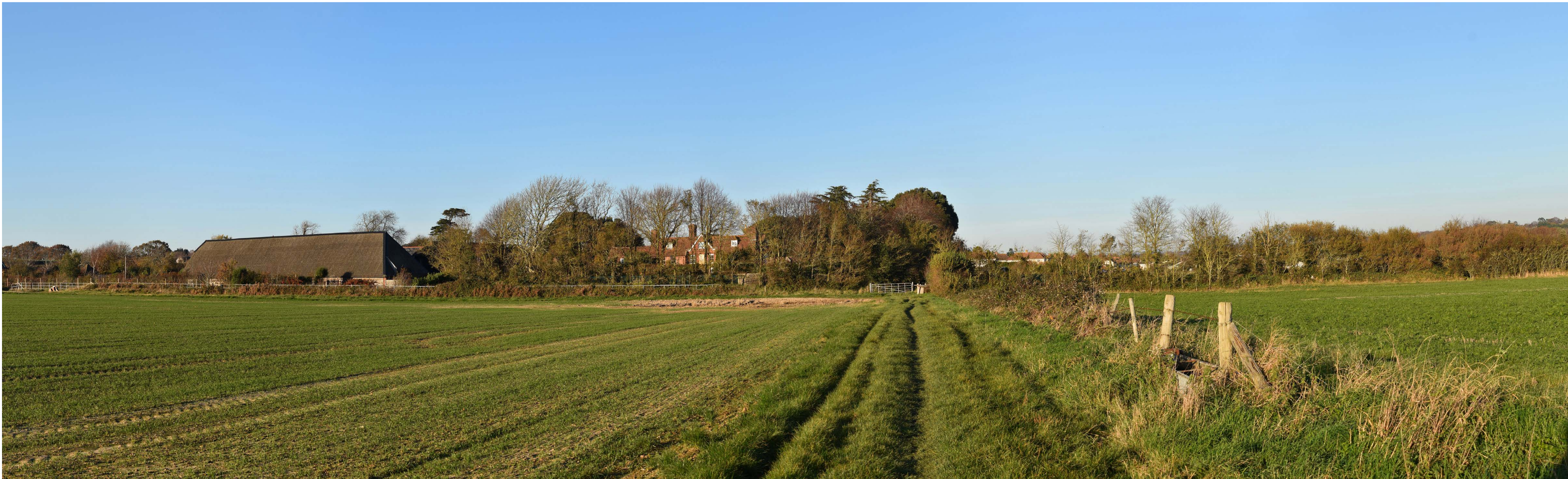
VIEWPOINT: 7 VIEW NORTH FROM FOOTPATH 34 SOUTH OF GREAT POSBROOK FARM. Photographs taken with a non-standard lens and not fully in accordance with the LI Visual Representation Guidance – Sept 2019

SLR Foreman Homes LAND EAST OF POSBROOK LANE, TITCHFIELD LANDSCAPE AND VISUAL IMPACT ASSESSMENT JOB NO. 403.07957.00003 DATE: NOV 2021 DRAWN: EW CHECKED: JS APPROVED: JS VIEWPOINT 3 DRAWING NO: 22