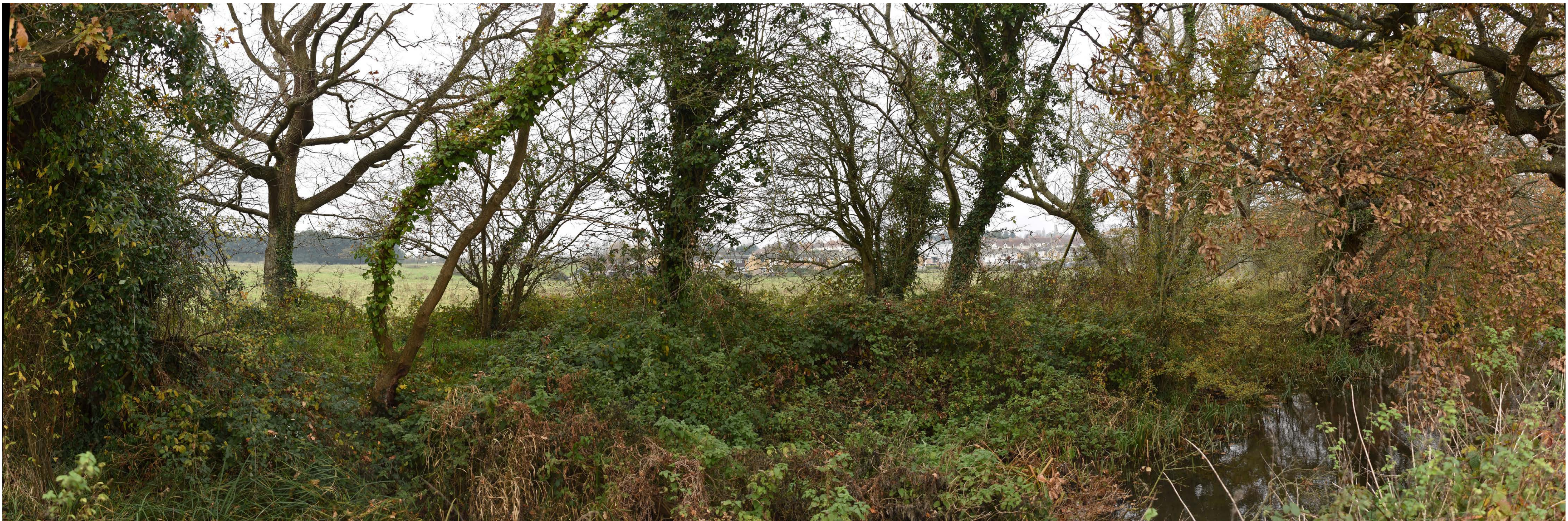
VIEWPOINT: 10 VIEW WEST FROM FOOTPATH 48, EAST OF SITE.

Photographs taken with a non-standard lens and not fully in accordance with the LI Visual Representation Guidance – Sept 2019