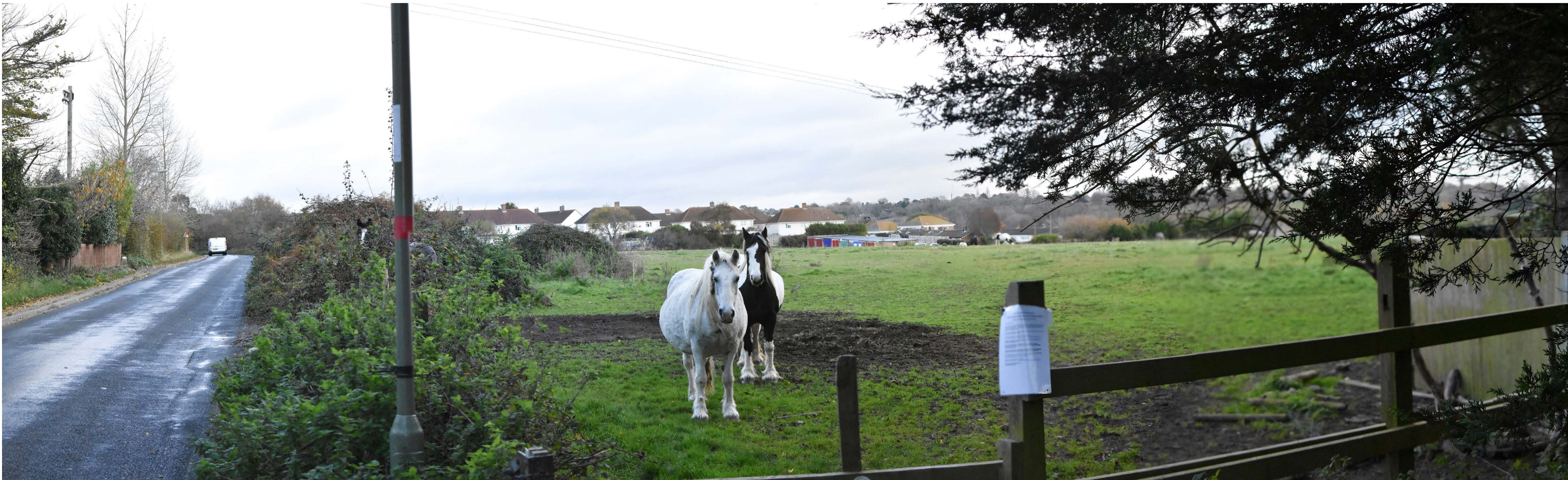
VIEWPOINT: 3 VIEW NORTH EAST FROM POSBROOK LANE AT JUNCTION WITH FOOTPATH 39. Photographs taken with a non-standard lens and not fully in accordance with the LI Visual Representation Guidance – Sept 2019